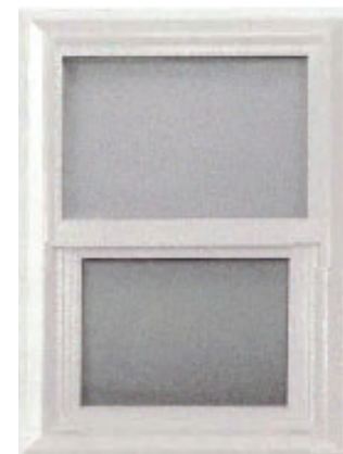
Single Hung Window, Obscure Glass