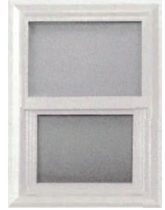
Single Hung Window, Obscure Glass